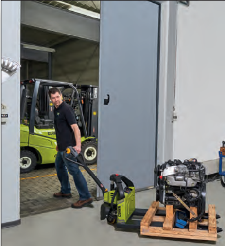
Ideal for use in industrial applications