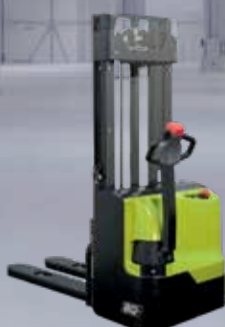
Pallet Stacker Multi-purpose Vehicle 2000 kg