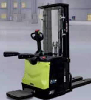
Pallet Stacker Platform version 1600 kg