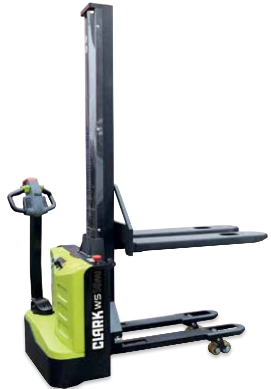
WS10M(i) Mono-Mast with initial lift