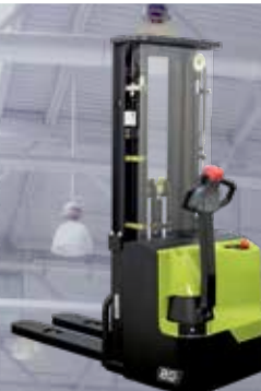
Pallet Stacker 1600 kg